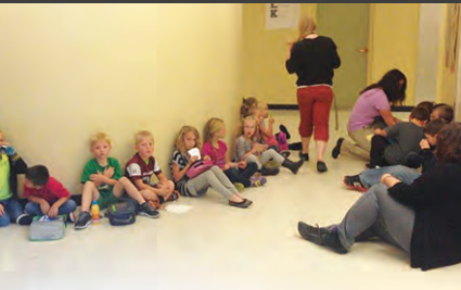
Left: Students eat lunch in the hallway because there is no room in the cafeteria.

Why are the repairs needed at the elementary schools? Our existing five elementary schools are aging with significant infrastructure needs. Our newest is almost 30 years old and oldest was built in 1929.