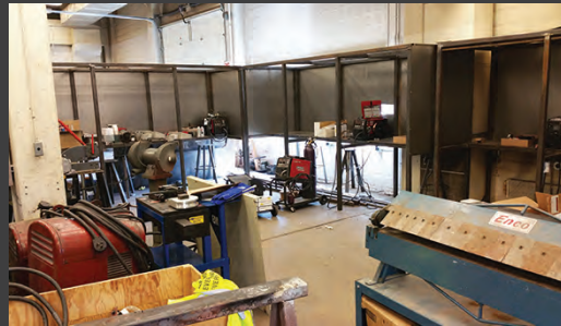
The Agricultural Education Center was built in 1978 and has not received a major update since that time.

Asbestos in the ceiling in the main hallways and on the half floors is part of abatement that this bond will address.