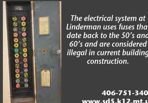
The electrical system at Linderman uses fuses that date back to the 50's and 60's and are considered illegal in current building construction.