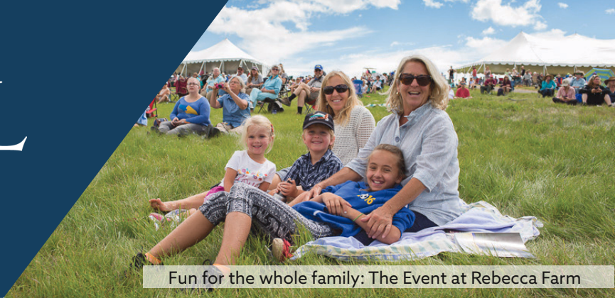
Fun for the whole family: The Event at Rebecca Farm

Chamber of Commerce Convention & Visitor Bureau