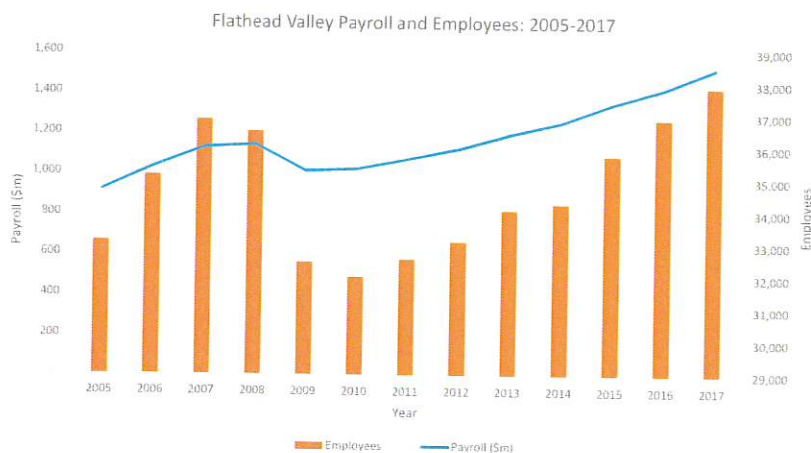
Figure 7 9