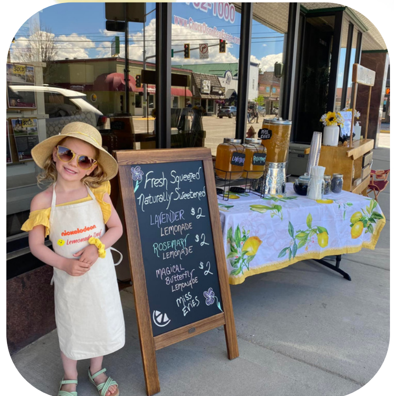
2022 Lemonade Day Kalispell Participant

CONNECTING EDUCATORS, STUDENTS AND JOB SEEKERS WITH EMPLOYERS