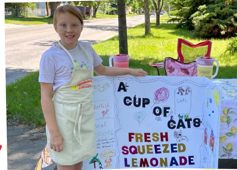
2022 Lemonade Day Kalispell Participant 2022 Best Tasting Lemonade Winner 2022 Most Unique Lemonade Name Winner

**Mentors are any Parents/guardians/siblings/teachers/youth organization leaders/family friends/or grandparents –any caring adult can help lead a child through the Lemonade Day lessons.