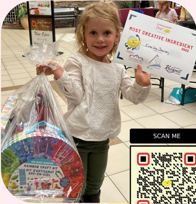
2022 Lemonade Day Kalispell Participant 2022 Most Creative Ingredient Winner

To kick off Lemonade Day Flathead 2023 events we are hosting a tasting contest for our Lemonade Day participants on June 11th from 2pm-4pm at Kalispell Center Mall. Please sign up early at https://bit.ly/42qYH0y