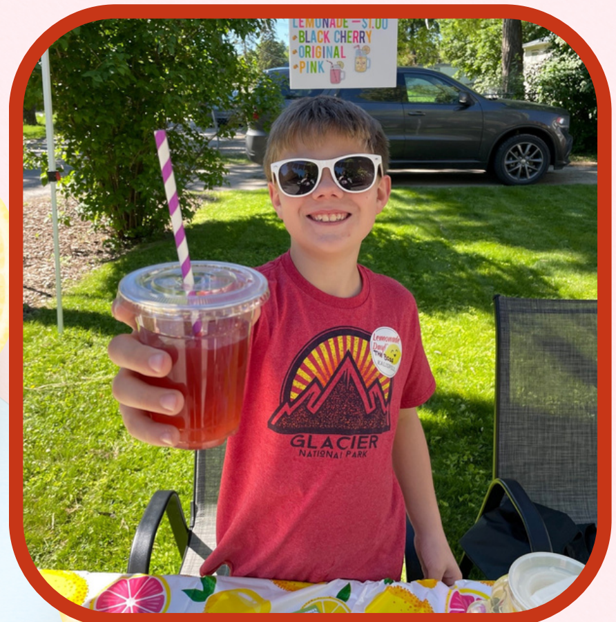
2022 Lemonade Day Kalispell Participant