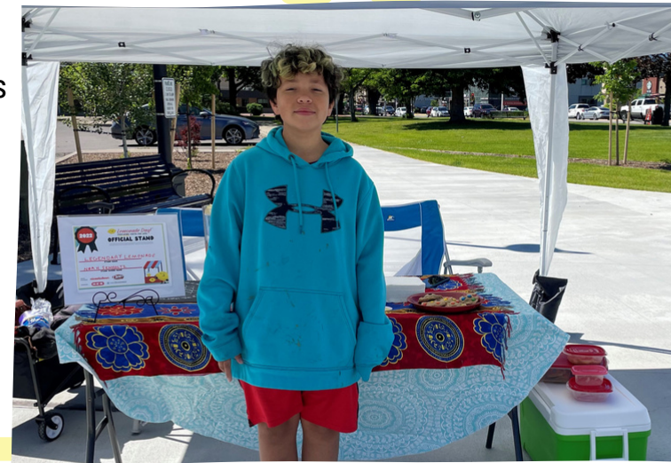
2022 Lemonade Day Kalispell Participant