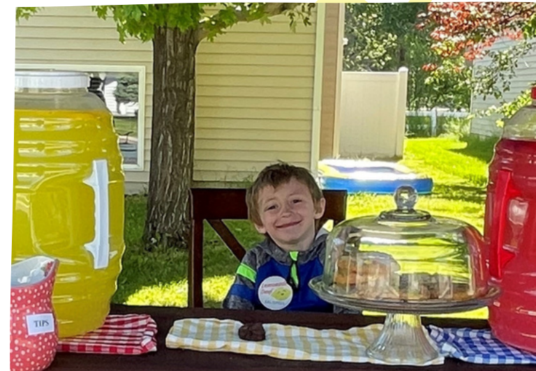
2022 Lemonade Day Kalispell Participant