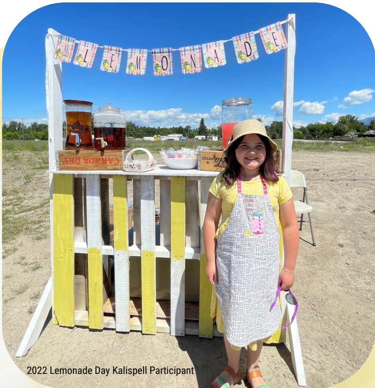
2022 Lemonade Day Kalispell Participant